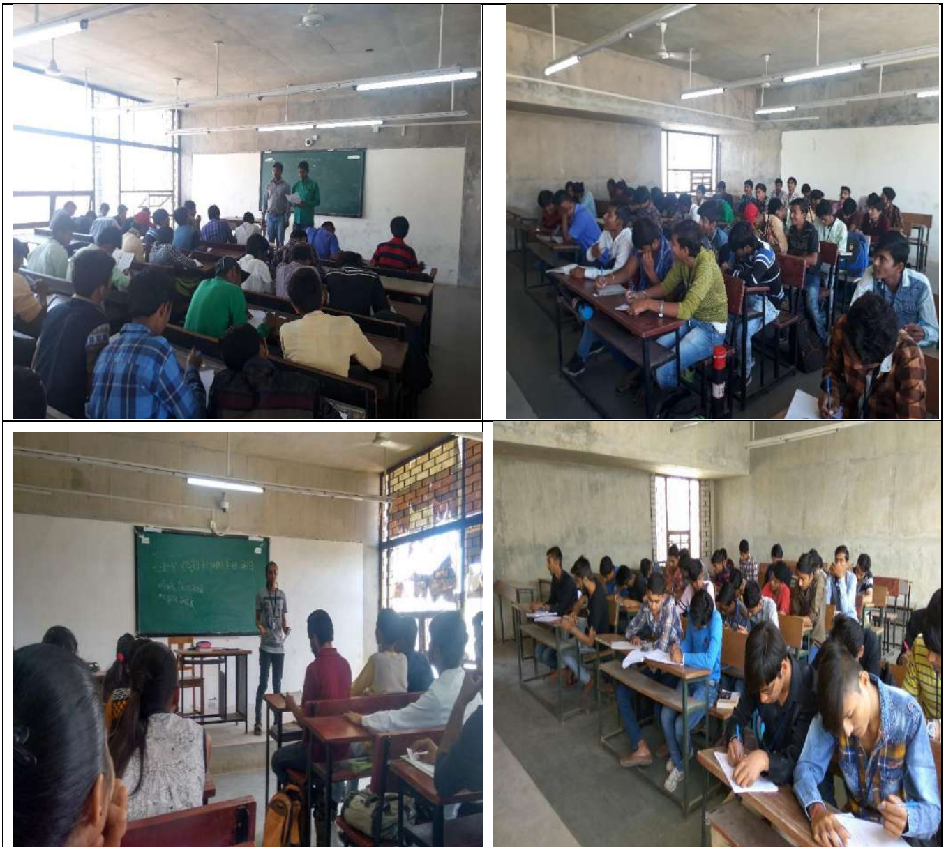
Essay and Elocution activity

These events are hosted by Mechanical, Civil, Computer, Electrical, and Mining Department which is been coordinated by I/C HODs and supported by staff of respective department. In this event around 176 students had participated. Department wise photographs of this event are as follows: