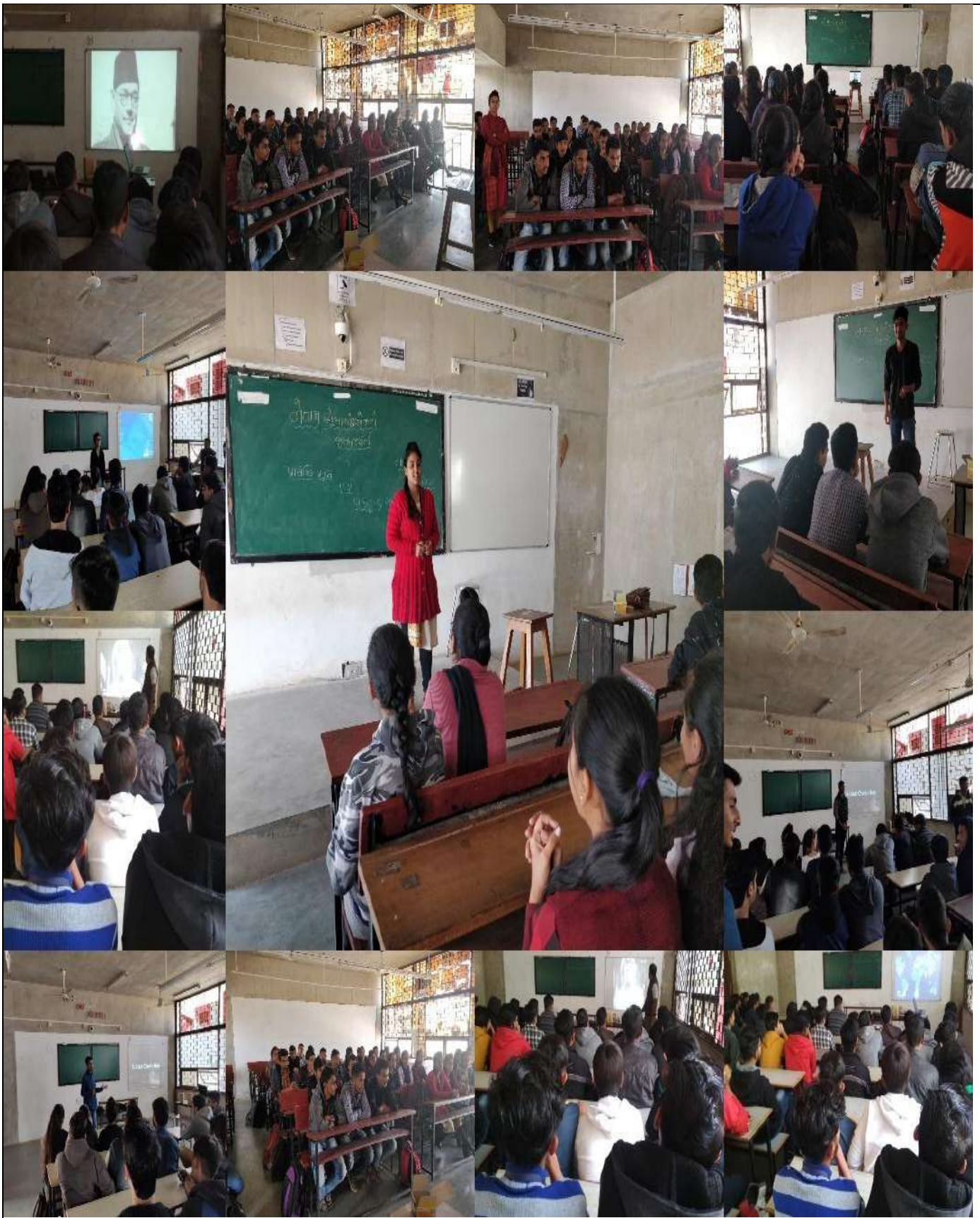
Collage of different events organized in the department