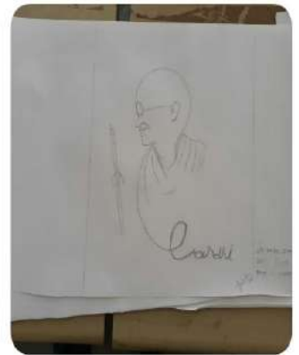
Drawings made by students