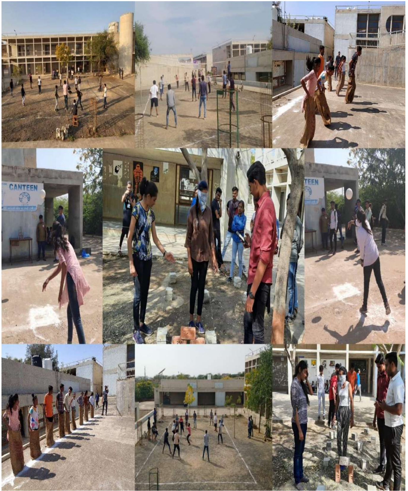
Photos of Trusted way, volleyball, glass shooting and sack race event